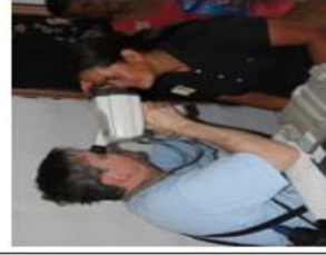
Measure their eyes