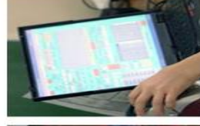
Find the right pair