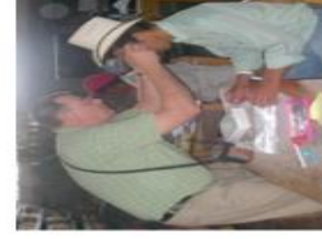
Fit the glasses