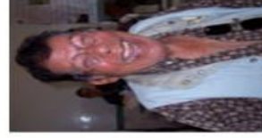
And watch for the smile

To sign up: Talk to your local Social service agency.